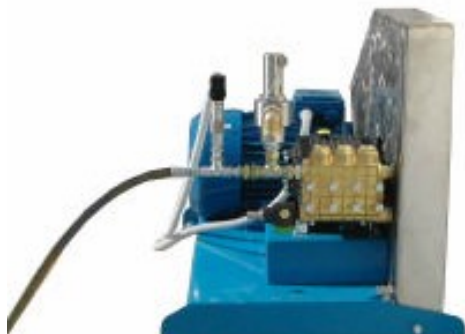
> N7/15 Detail