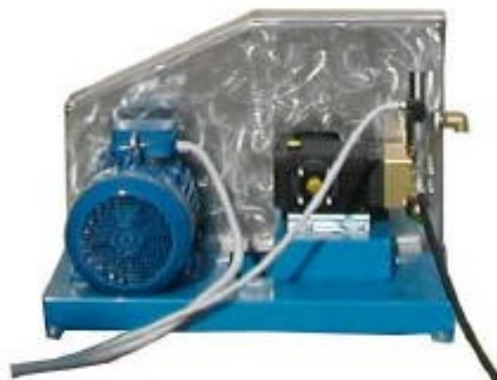
> N7/15 Detail