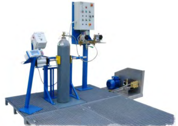
Complete CO 2 station filling