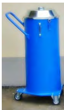
OPTIONS: POWDER RECOVERY TANK CONTAINER 110 lt average