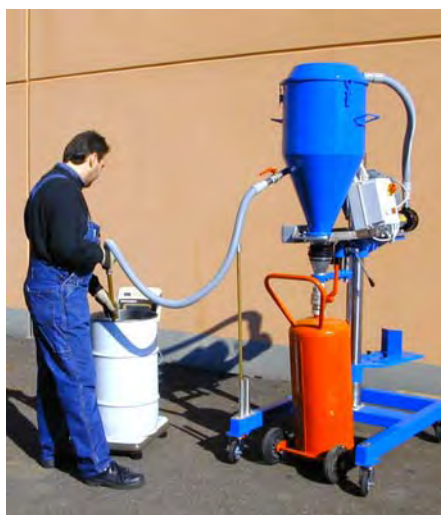
FILLING OF WHEELED FIRE EXTINGUISHER