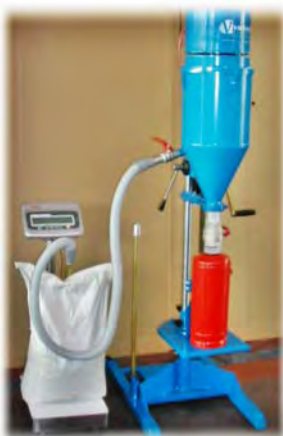
FILLING OF PORTABLE EXTINGUISHER