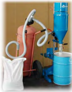
FILLING OF WHEELED EXTINGUISHER